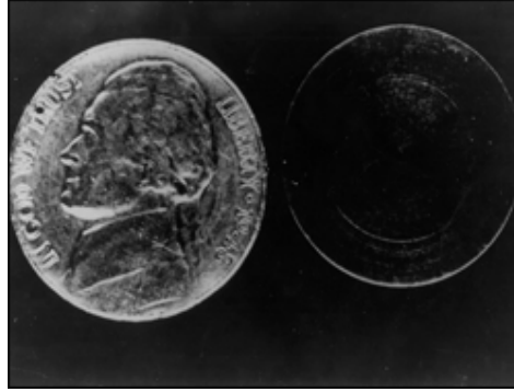
THE "HOLLOW NICKEL" OPENED UP 92