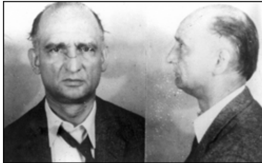
FBI MUG SHOT OF RUDOLF ABEL 33

The Abel case is a fecund study worthy of book-length treatment. 32 In this brief article, I will explore just three topics: the appointment of counsel; the defense's investigation and cross-examination of witnesses for the prosecution; and the defense motion to suppress the evidence obtained through the tandem conduct of the FBI and the INS that midsummer's morning. It was this motion that brought Abel's case to the attention of the highest court in the land.