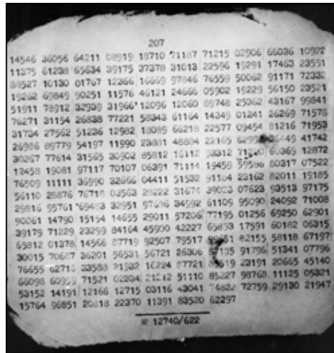
ENCRYPTED MESSAGE HIDDEN WITHIN THE HOLLOW NICKEL